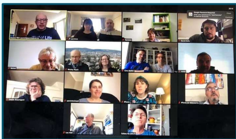
Weekly staff meeting online!

Staff members, on the other hand, continue to work from home and through virtual meetings. We meet each week for a time of prayer together, to update ourselves in different departments. We also take the time to reflect on our vision for both our short- and long-term programs. Pray with us for God's guidance.